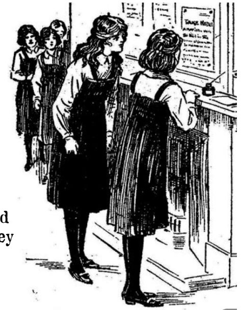
"How Spiffing.... You and I are down for the hockey trials on Thursday"